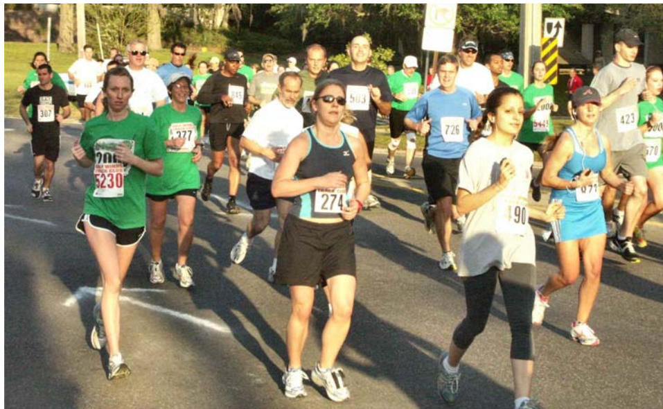
A group of Springtime runners on Lafayette Street

Pizza Shop Slogan: "7 days without pizza makes one weak."