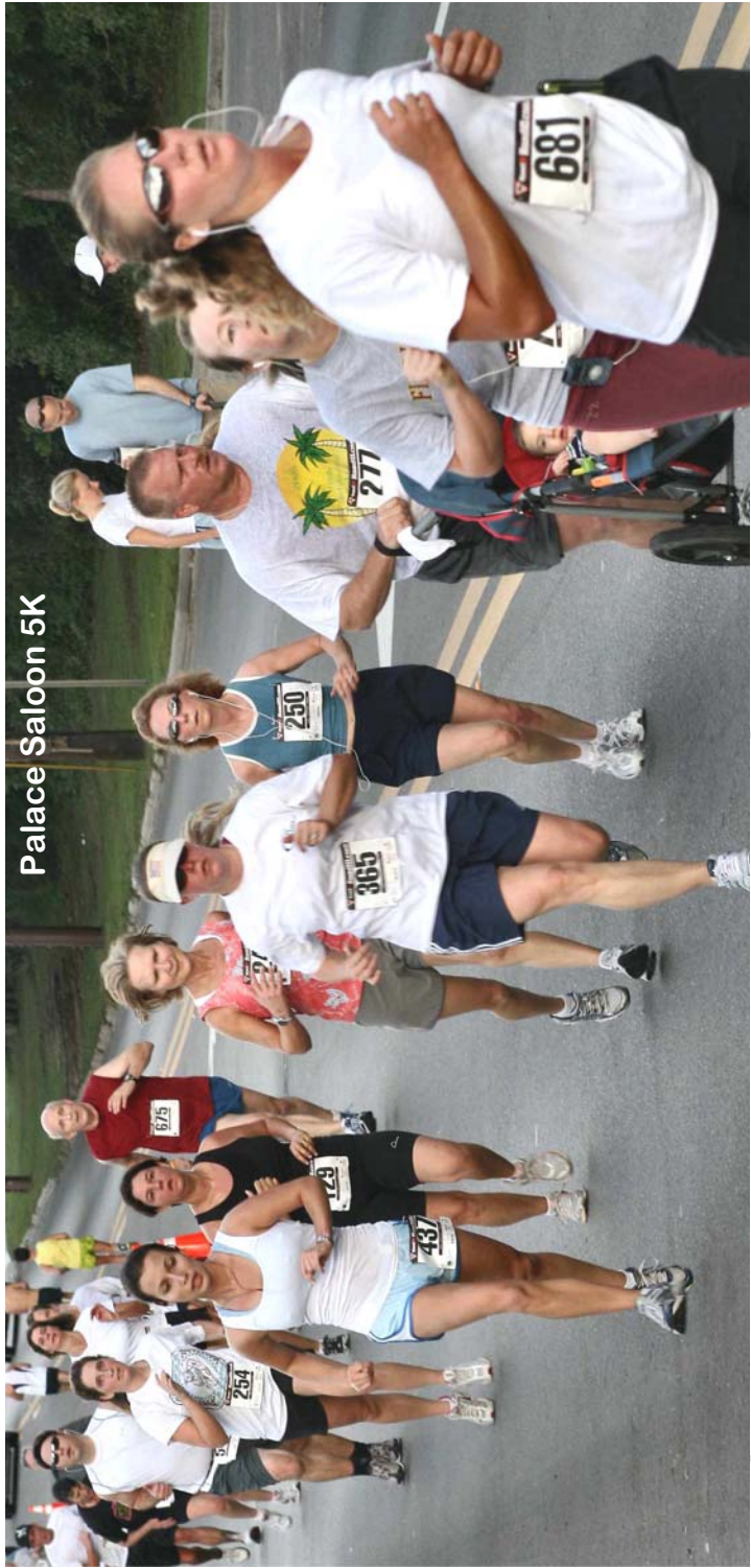
Palace Saloon 5K

Gulf Winds Track Club P.O. Box 3447, Tallahassee, FL 32315 Gulf Winds Membership Card