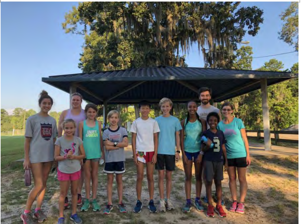
SMIRF (Summer Mornings Include Running Fun)

TPCA Tallahassee Primary Care Associates Our primary care is you.